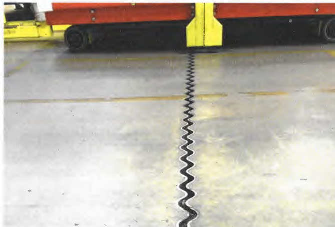
State of the joints after 9 years of intense forklift traffic